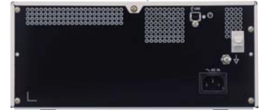
UP-D55MD Back Panel